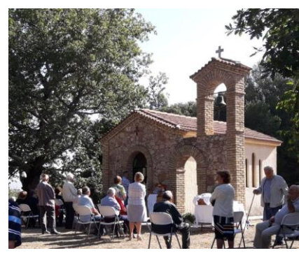
The Nativity of Virgin Mary Chapel

condition, as well as that of Chapel of Archangels Gabriel and Michael at the entrance of the village which is also the newest church (1998) of our parish. Furthermore, the chapel of the Nativity of the Virgin Mary in Foteinou is also in very good condition. Also, shortly before I took over, the chapel of Agia Kyriaki on the road to Sparta had recently been renovated ( writer's note: in 2018 at the initiative of the "Aqioi Anargyri" Club ).