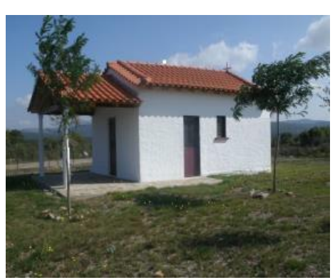
The Agia Kiriaki Chapel