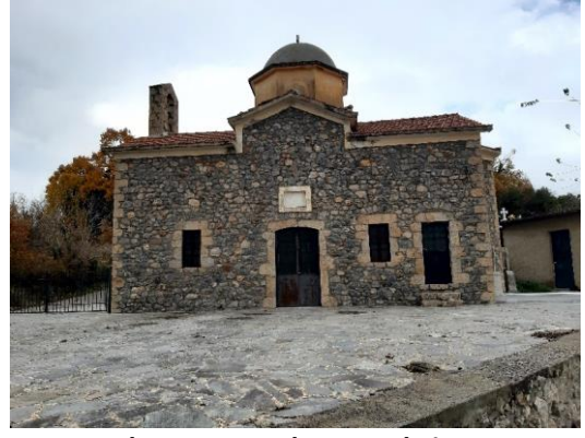
The renovated external view of Agios Nikolaos chapel

In conclusion, as you can see, a lot has been done, a lot is being done and a lot remains to be done. Our aim is to ensure that all the money resources of our parish are properly managed and the patriot donors to whom we thank them once again.