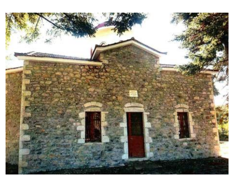
The Agioi Anargyri chapel

However, the chapel we focused on was that of Agios Georgios in the Karyatic plain ("Arachovitikos campos"), where we proceeded with oil painting works both inside and outside the chapel and in the maintenance of the windows, while the roof is immediately being repaired.