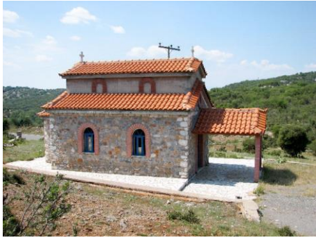
The Archangels "Taxiarhes" chapel

P.L. After a fully completed survey, the conclusion is that the chapels of Saints Constantine and Helen and Saint Barbara in the forest above the village are in good