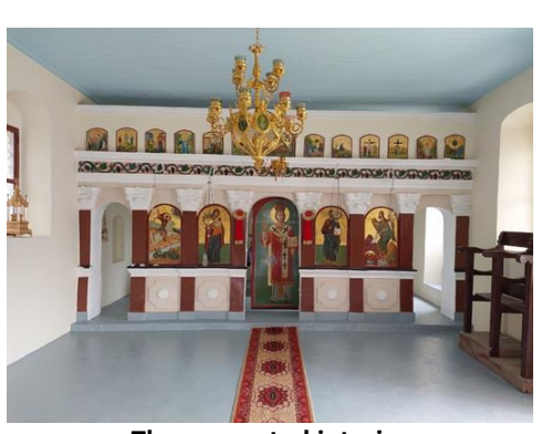
The renovated interior of Agios Georgios Chapel

For the Chapel of Agioi Anargyroi , when I took over, extensive foundation strengthening, maintenance and renovation work had begun and was completed at the initiative of the "Agioi Anargyroi" Club and with contributions from patriots, as you had presented in detail in your previous issues. These works have been completed and now the Ecclesiastical (Church) Council is proceeding, using money from its reserve, to implement the final phase of the works inside the Chapel (oil painting).