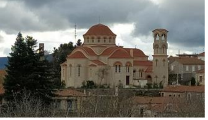
Today's external view after the completion of the works at the main church of Agios Andreas

After all, I had emphasized upon assuming my duties, that the first and absolute priority - before any other action of mine - would be the maintenance and good operation of the central temple of Karyes.